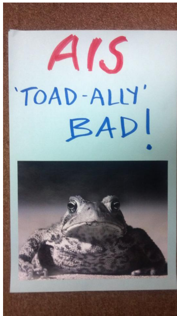
Photo entry example. 8 x 10 photo on 11 x 17 paper.

(For inspiration only, artwork is copyrighted .)